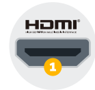
1 HDMI Input